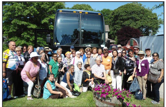
Encore seniors head home after a fun-filled day at Pindar Vineyards on Long Island.

The seniors pictured here were delighted to take a bus trip to Pindar Vineyards on the North Fork of Long Island on June 26, a popular destination for many New Yorkers. Encompassing more than 500 scenic acres, Pindar Vineyards offers magnificent vistas and informative lectures on winemaking. Afterwards, seniors headed over to a local restaurant offering waterfront dining, where they enjoyed a delicious luncheon while relishing the lovely water views of Long Island Sound. Our seniors agreed the day offered a welcome reprieve from the crowded streets of the city.